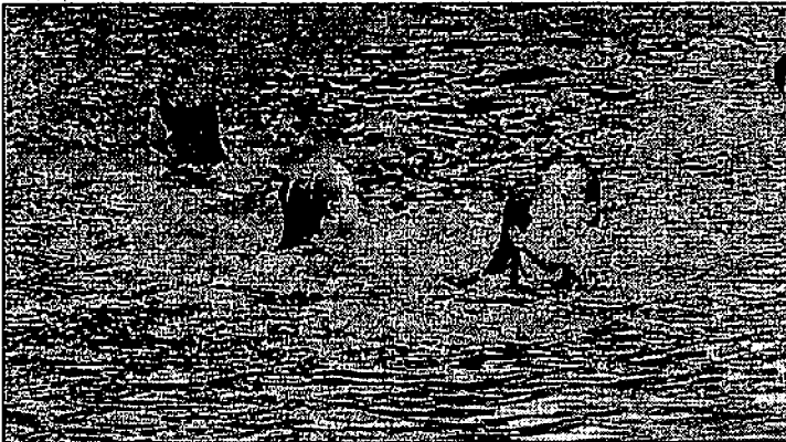
Heads pop up out of the water as swimmers go to the float for another jump.